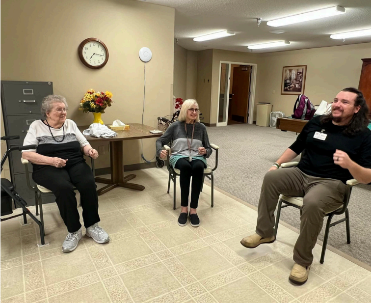
Knutson Place tenants enjoyed fun and laughter during their weekly fitness class! Good job to everyone on staying active and healthy!