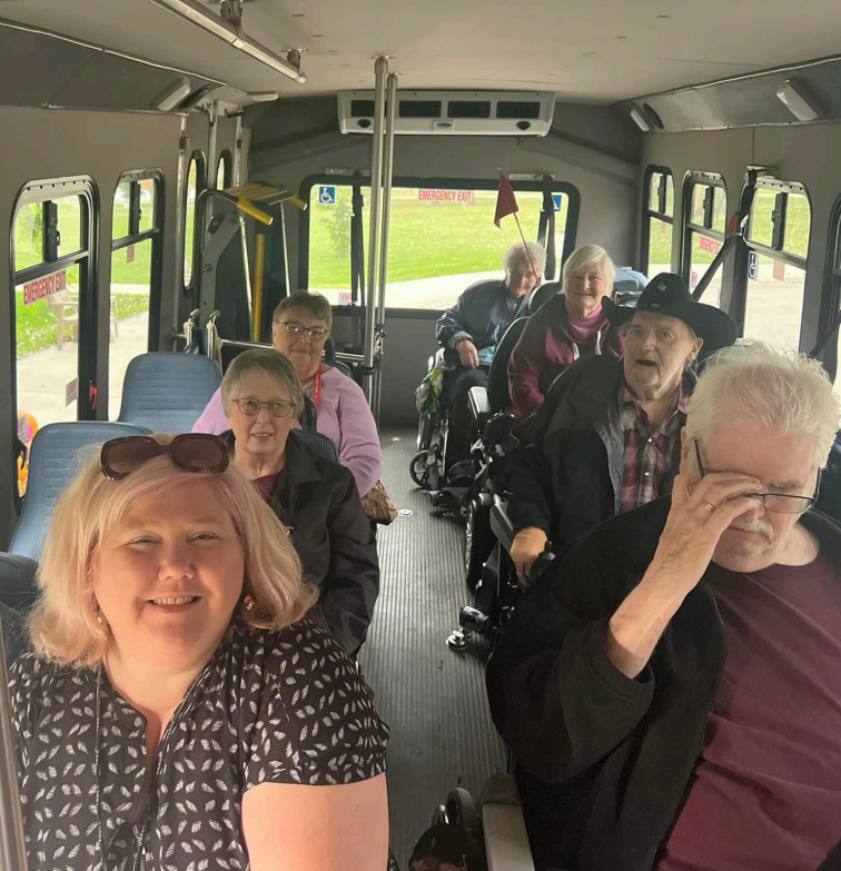
Winner winner chicken dinner! St. John's residents hit the jackpot with a super fun and exciting outing! They enjoyed a fun-filled morning at Diamond Jo casino with good friends and neighbors!